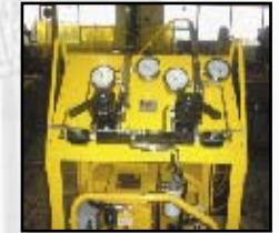
Special Application Product