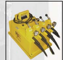
Die Splitting Systems